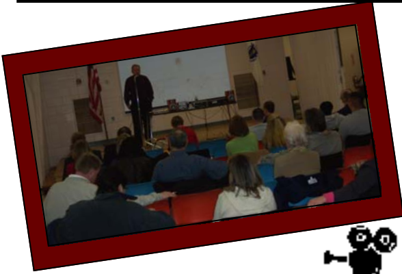
SHOW YOUR LOVE ~ December 7, 2006 Elm Park Community School ~ Worcester, MA