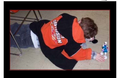
Dads & Kids Luncheon & Basketball Game ~ February 17, 2007 College of the Holy Cross ~ Worcester, MA